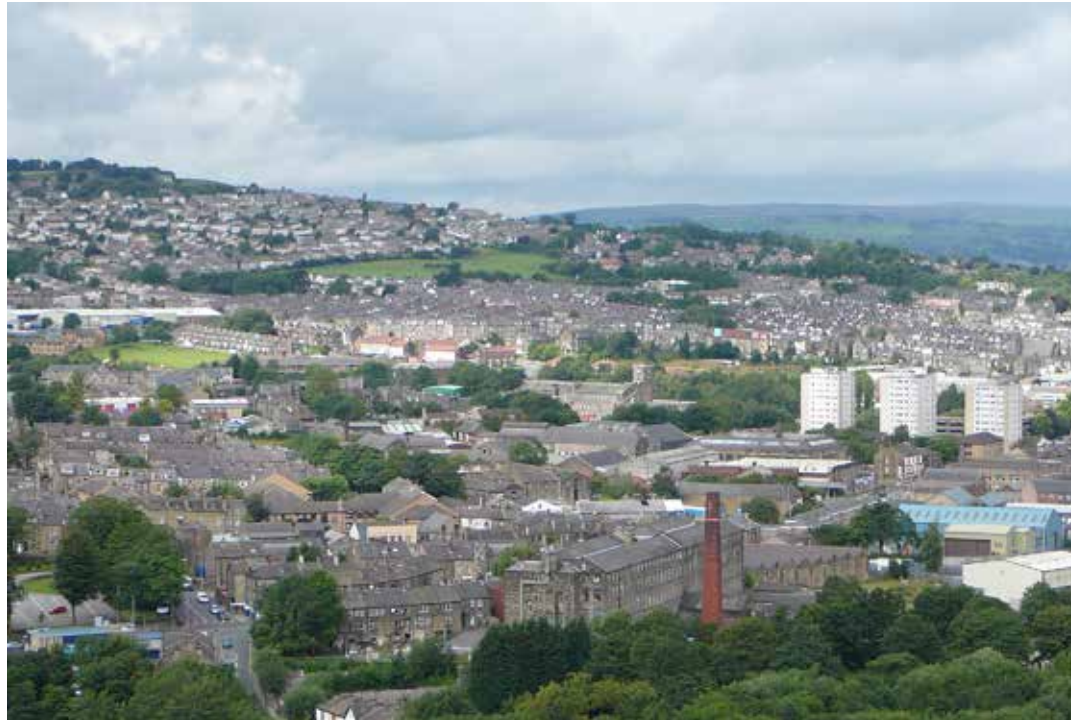
View of Keighley

Airedale Enterprise Services, Keighley’s local enterprise agency will deliver the project in Keighley & Bradford Council will